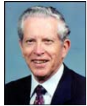
Sen. Lowen Kruse

local officials in the municipality where the license is sought.